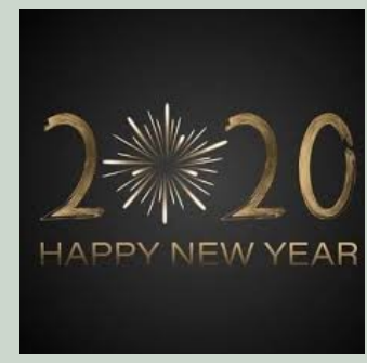
Things to do in Minnesota for New Years!